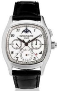
Lot 2412 PATEK PHILIPPE. A RARE PLATINUM CUSHION-SHAPED PERPETUAL CALENDAR SINGLE BUTTON SPLIT SECONDS CHRONOGRAPH WRISTWATCH WITH MOON PHASES, DAY/NIGHT, LEAP YEAR INDICATION AND LACQUERED WHITE DIAL WITH BLACK BREGUET NUMERALS, REF. 5951P-012, CIRCA 2015

All Patek Philippe contemporary masterpieces from The Kairos Collection Part II found buyers, including the following highlights: