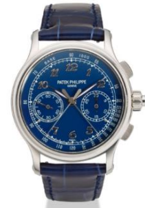
Lot 2408 PATEK PHILIPPE. A RARE PLATINUM SPLIT SECONDS CHRONOGRAPH WRISTWATCH WITH BLUE ENAMEL DIAL AND BREGUET NUMERALS, REF. 5370P-011, CIRCA 2020

Price realised HK$2,394,000/ US$306,410 Pre-sale low estimate: HK$ 1,450,000 / US$185,587