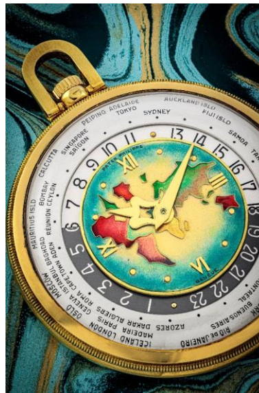
Important Watches and The Rise of The Independent Watchmakers, Featuring The Kairos Collection Part II

More than doubling its pre-sale low estimate of HK$10,000,000/ US$1,279,910