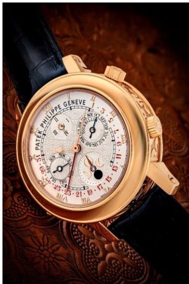
The Champion Collection Part III: The Artistry of Complications

Top lot of each sale set world auction record for the reference: