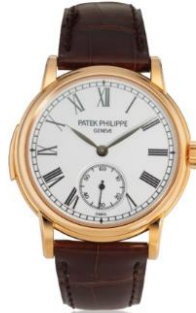
Lot 2413 PATEK PHILIPPE. A RARE 18K PINK GOLD AUTOMATIC MINUTE REPEATING WRISTWATCH WITH ENAMEL DIAL, REF. 5078R, CIRCA 2015

Price realised: HK$2,772,000/ US$354,791 Pre-sale low estimate: HK$1,600,000 / US$204,786